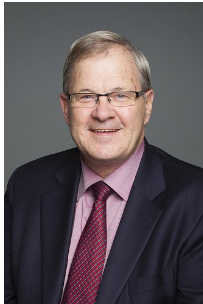
Hon. Lawrence MacAulay, PC, MP Minister of Agriculture and Agri-Food

A handwritten signature in blue ink that reads "Lawrence MacAulay".